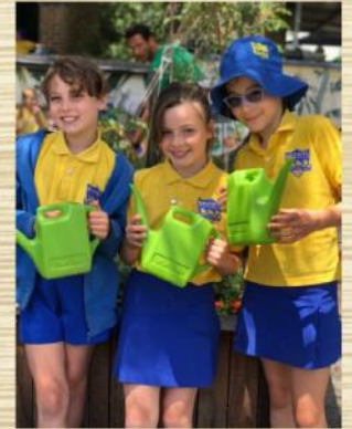
We did lots of planting today.