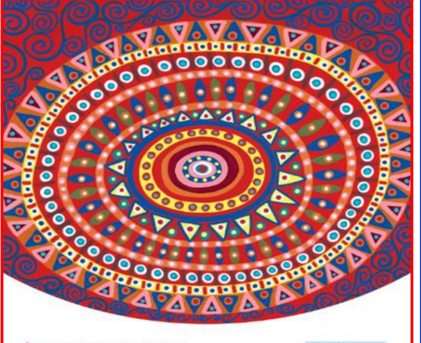
NSW Department of Education