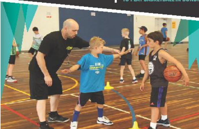
Bronte Public School

CHECK OUT WWW.EASTSBL.COM.AU FOR INFORMATION ON JOINING A TEAM OR LEARNING TO PLAY BASKETBALL IN BONDI