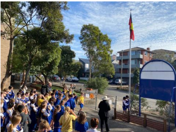
Bronte Public School