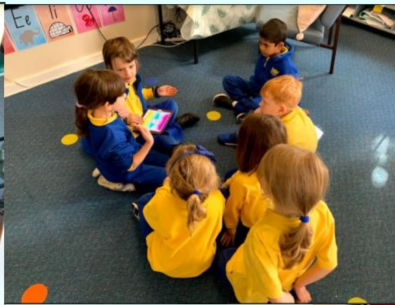
On the left, students from 1/2Y share their work with Kindergarten students.