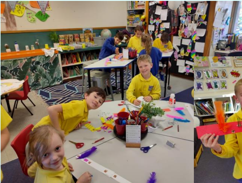
After reading Chicken Divas 1/2Yellow make headpieces.