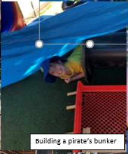
Building a pirate's bunker