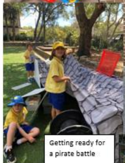
Getting ready for a pirate battle