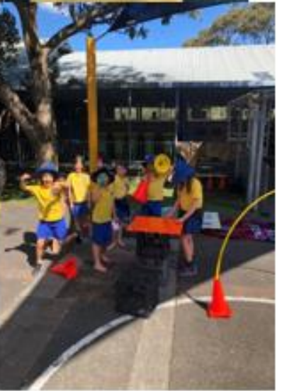
Ocean Hotel Resort