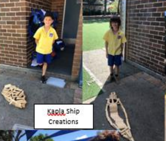
Kapla Ship Creations