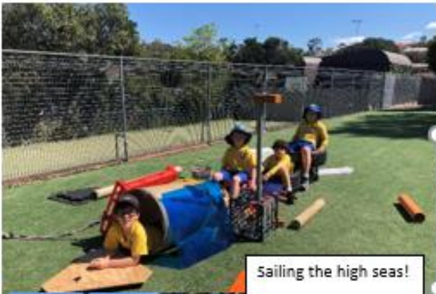
Sailing the high seas!