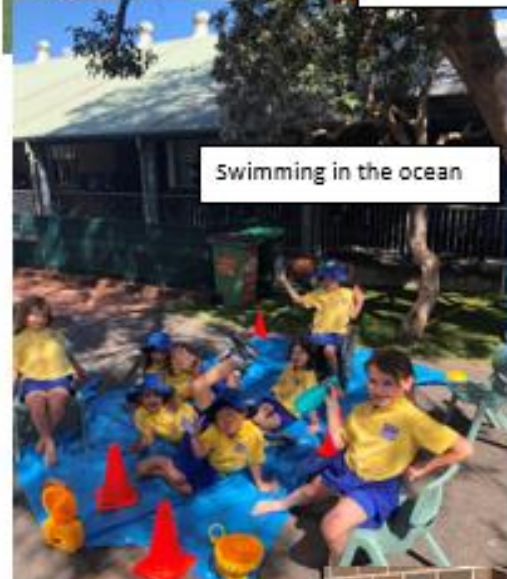
Swimming in the ocean