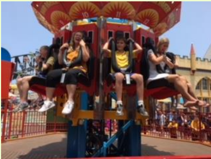
Students in Stage 3 celebrated the end of the year at Luna Park yesterday.

Thanks to the amazing K-2 BBQ team who saved the picnic after it was discovered the Gully BBQs didn't work.